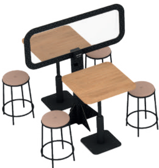
Indoor Column Extender 90 cm