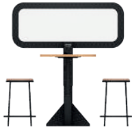
Extender 90 cm