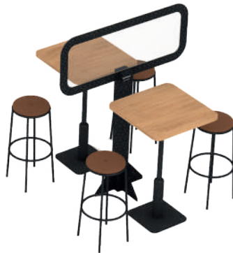
Indoor Column Extender 110 cm