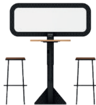
Extender 110 cm