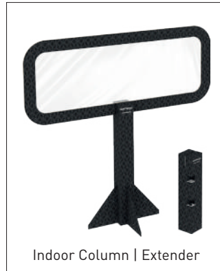
Indoor Column | Extender