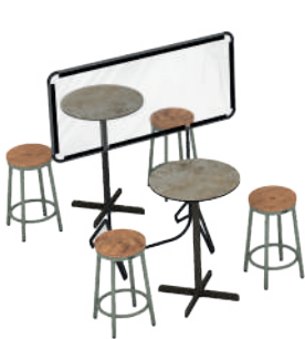
Outdoor Panel Extender 90