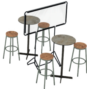
Outdoor Panel Extender 110