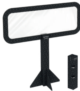
Indoor Column | Extender

visit the website for details and availability